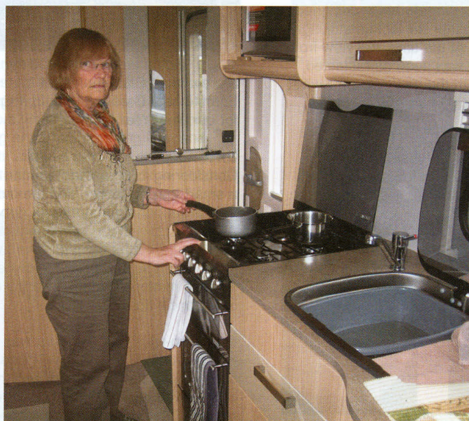
Gas hob and cooker including an electric hotplate.