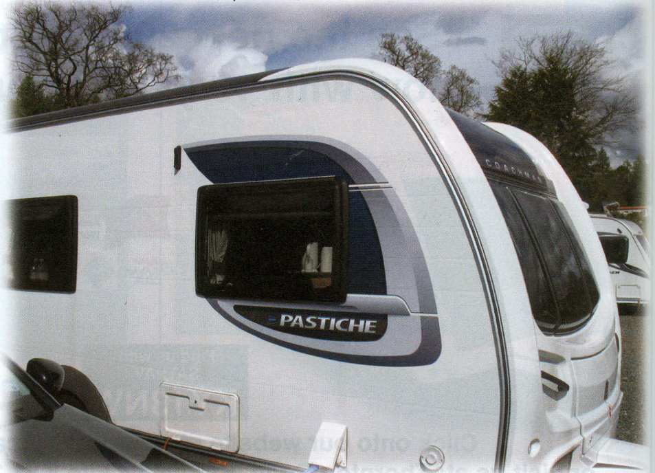
The spectacular graphics on the Pastiche.