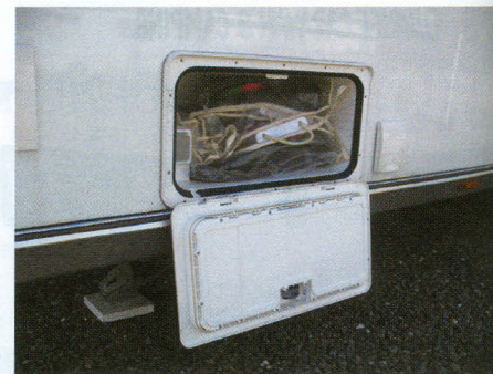
Wet locker which comes in handy and also houses the 13 amp socket for outside use.

We then journeyed to the east coast of Scotland, to Cairnsmill Caravan Park at St Andrews. We had no real problems,