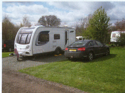
Clays Touring and Leisure Park, in the South.