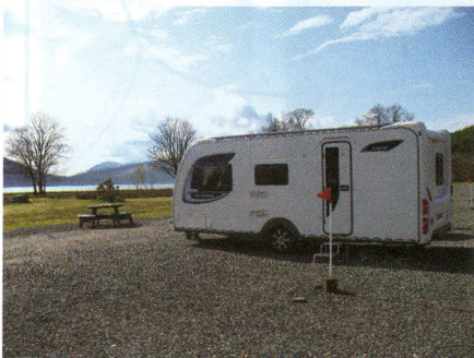
Argyll Holiday Park, in the West.

OVER the last 18 weeks, we have had journeys to the Highlands, Wales, the east of Scotland also the west of Scotland. On all these trips, the Pastiche has behaved itself very well indeed, whether it had to negotiate some twisty Highland roads or soar along happily on quite a number of motorways.