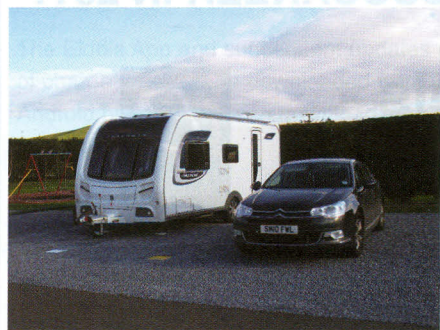
Cairnsmill Caravan Park, in the East.