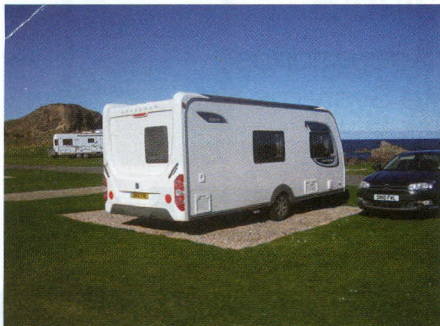
Findochty Caravan Park, in the North.