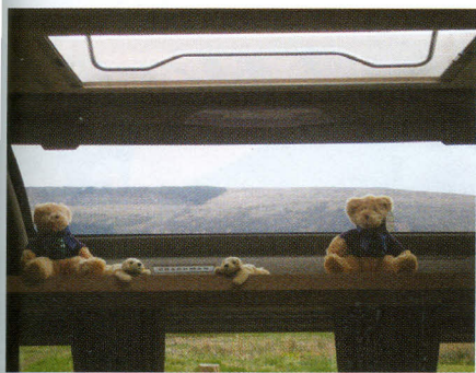
The new front window allows for panoramic views

and by that time we were really enjoying the experience that this 'van can give you.