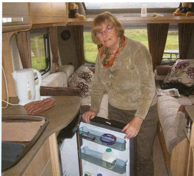
An excellent Thetford fridge.

We hope to cover more miles with the 'van over the next few weeks, and we will bring you our final verdict in our next issue.