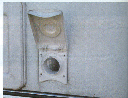
Awning heater vent.