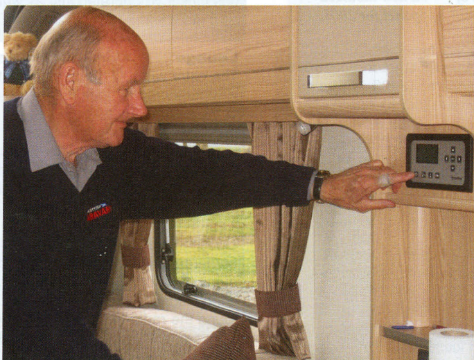
The new computerised heating system by Truma.