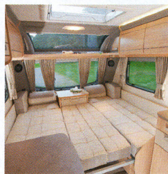
An aluminium frame pulled from the offside bed box (top) makes it easy to create a large double bed