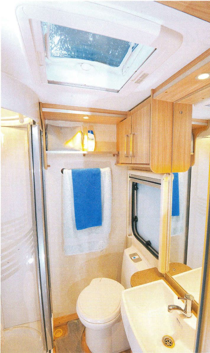
The corner washroom is another distinctive feature of the floor plan, with a separate shower, ample floor space to dress and plenty of towel hooks

» the adjacent wall mirror. In front of the bunks and wardrobe is space where little ones can get dressed or play, and the entire area can be closed off by a folding door, effectively creating a separate bedroom. It also permits adults to reach the washroom without disturbing the children.