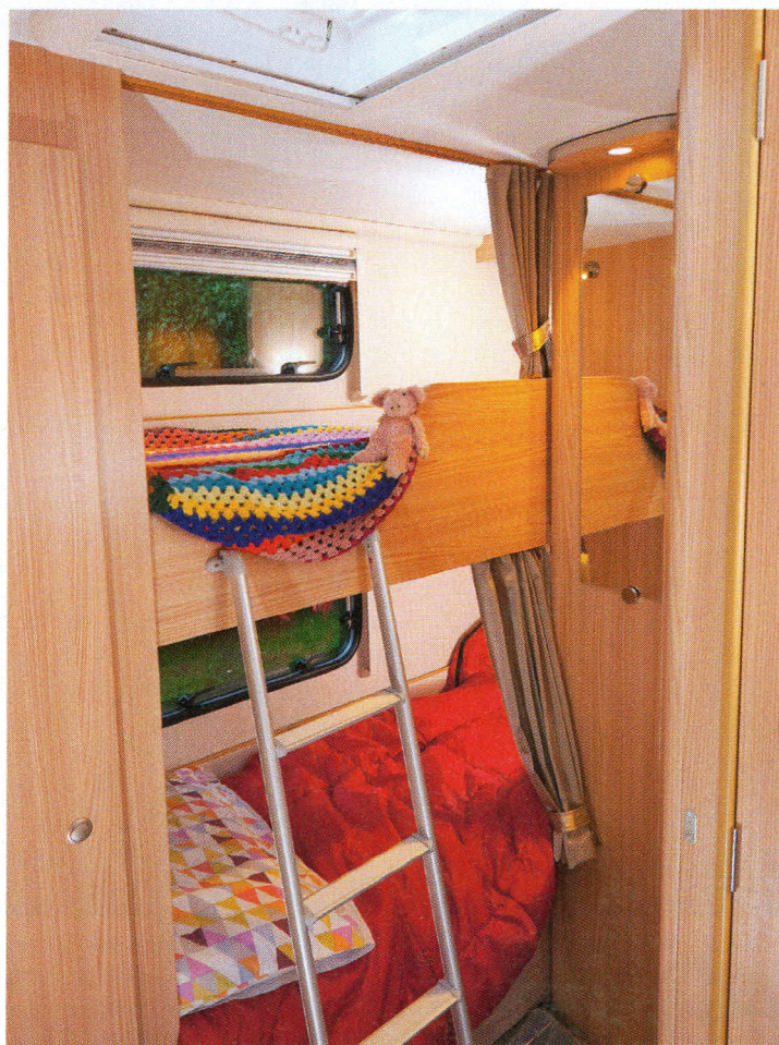
Separate reading lights, windows and a downlight above the mirror make the children's room a pleasant place at bedtime or playtime