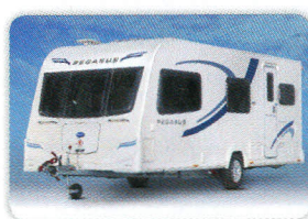
Bailey Pegasus II Ancona