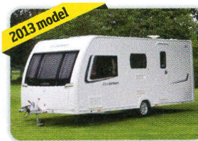
Lunar Clubman ES