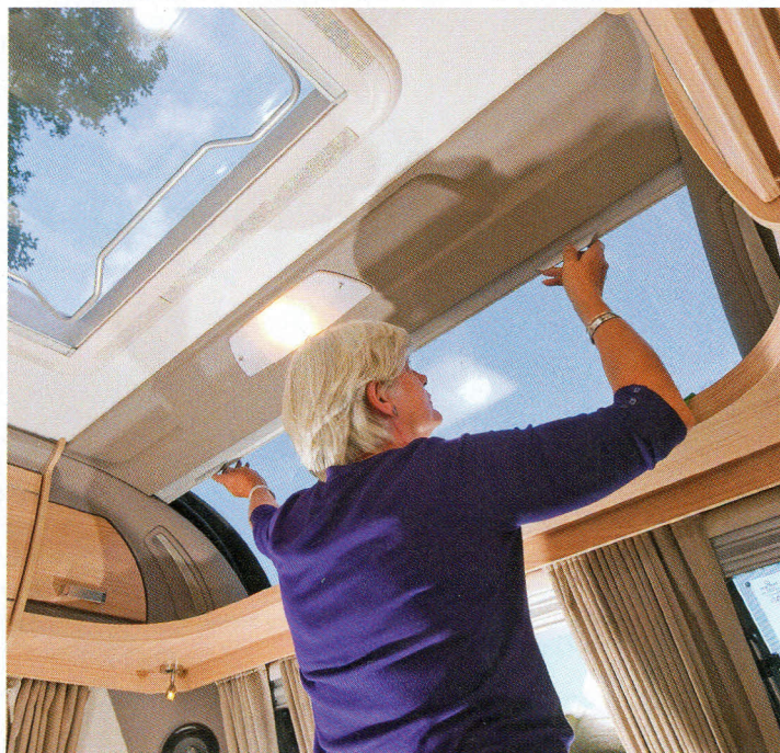
The panoramic window across the front joins the rooflight in flooding the lounge with daylight. It's flanked by side cubbies and a long front shelf

there's plenty of room for easy access to the gas bottles.