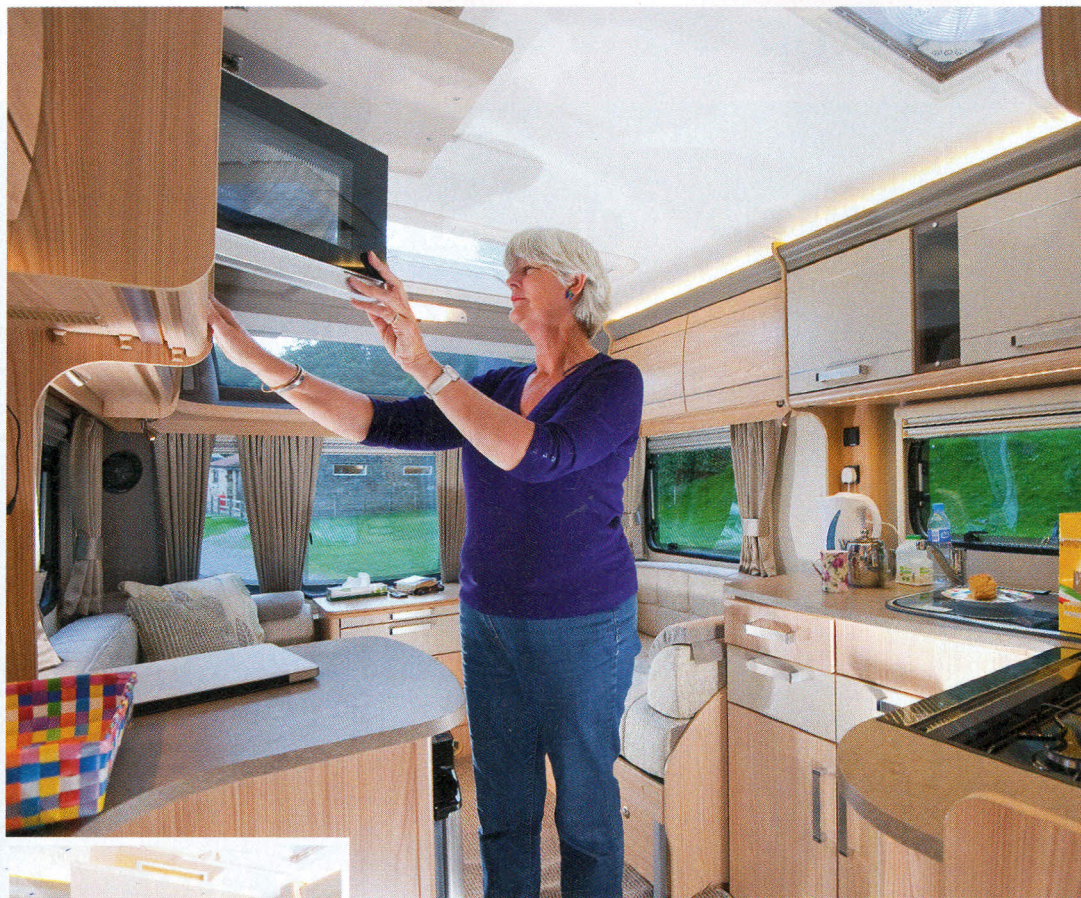
The Pastiche provides a midships kitchen that is designed to be used, with lots of worktop and storage, two sockets and all the appliances you need