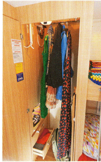
The wardrobe has drawers that are ideal for children's clothing

Storage options abound throughout the Pastiche, not just in the kitchen, where it's excellent. The front seat bases