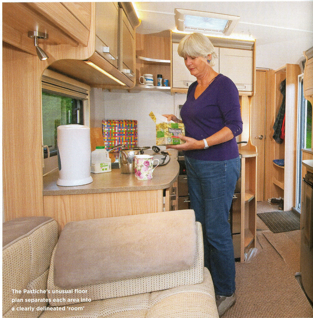
The Pastiche's unusual floor plan separates each area into a clearly delineated 'room'

The panoramic window, high-profile roof rails, one-piece aluminium sides and alloy wheels give the 525/4 a sleek, modern look.