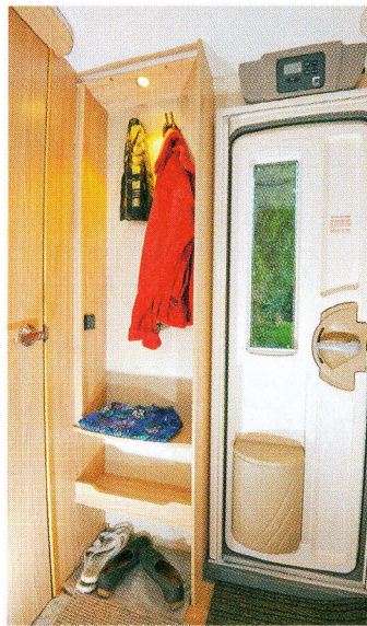
The small alcove includes a place to hang wet jackets and put shoes

can hold bedding during the day. Space under the offside seat is compromised by the main electrical unit and the Combi boiler housed here, but there is some room and access to the space is easy, thanks to the hinged lid, which is supported by a gas strut. The central chest has three drawers and a slide-out extension top. A shelf under the panoramic window replaces lockers that otherwise would be on the front wall of the van, leaving two wide lockers and a small cubby with a door on either side of the van.