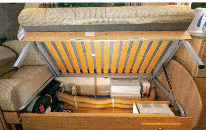
Despite all the gear in the offside seat box, it still has some storage space

There's plenty of space for four to lounge in comfort on the 6ft 2in-long sofas and for four to dine at the free-standing table, which is stowed in the wardrobe. The table is large, though, which makes it difficult to wriggle around before sitting down. »