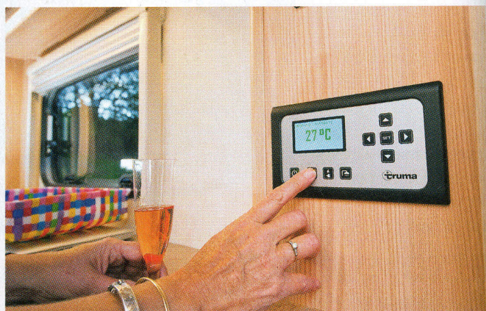
There are separate controls for the Combi space heater and water boiler

An AKS stabiliser, external gas and 230V output and a water inlet are standard for the range. Heavy-duty steadies are easily accessed at the front and although there are no guide tubes for those at the rear they shouldn't present a problem. The stand-on hitch cover is ideal for cleaning the roof window. The wide, front gas locker looks like a big, smiley mouth; open it up and