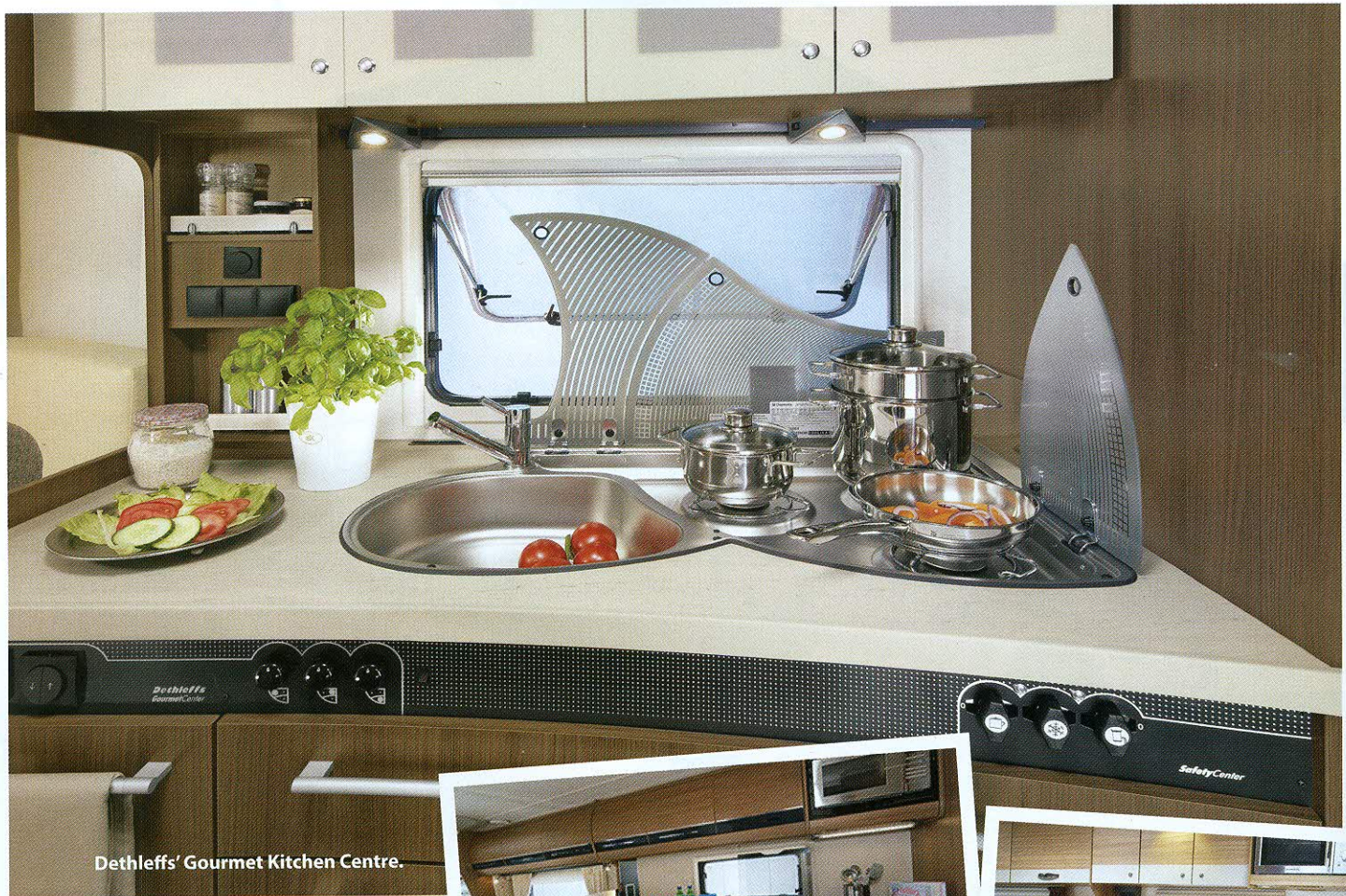
Dethleffs' Gourmet Kitchen Centre.

How much do you enjoy cooking? Discover Touring offers some advice on selecting a 'van for its kitchen.