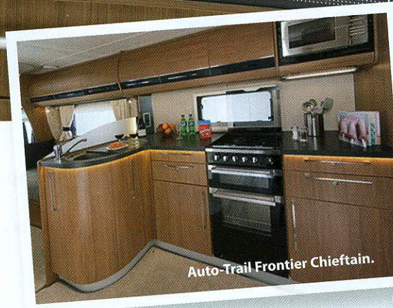
Auto-Trail Frontier Chieftain.

How much do you enjoy cooking? Discover Touring offers some advice on selecting a 'van for its kitchen.