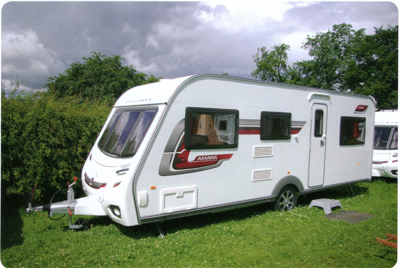
◆ All Amaras now come with one piece aluminium side panels.

The Pastiche 470/2 is dropped in favour of the 525/4. This is a very clever design that stole the show for many of those attending. With an internal length of 5.8m (19ft 0in) it somehow