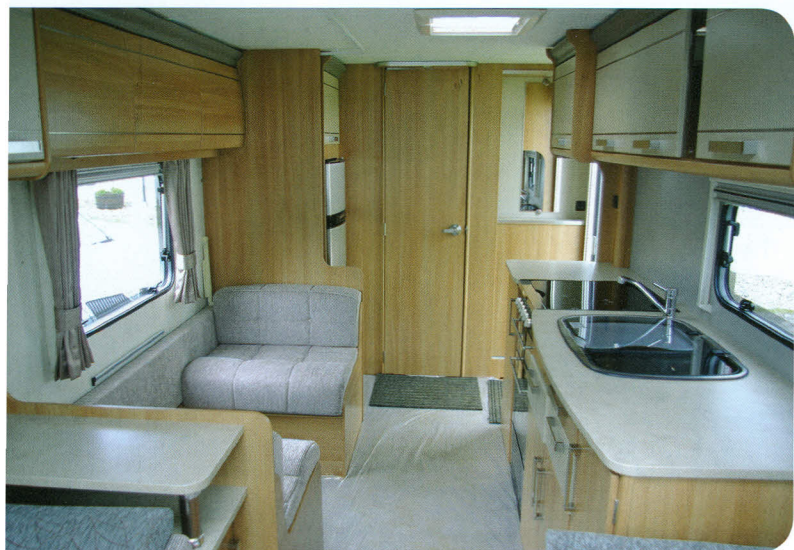
◆ Laser 620/4.