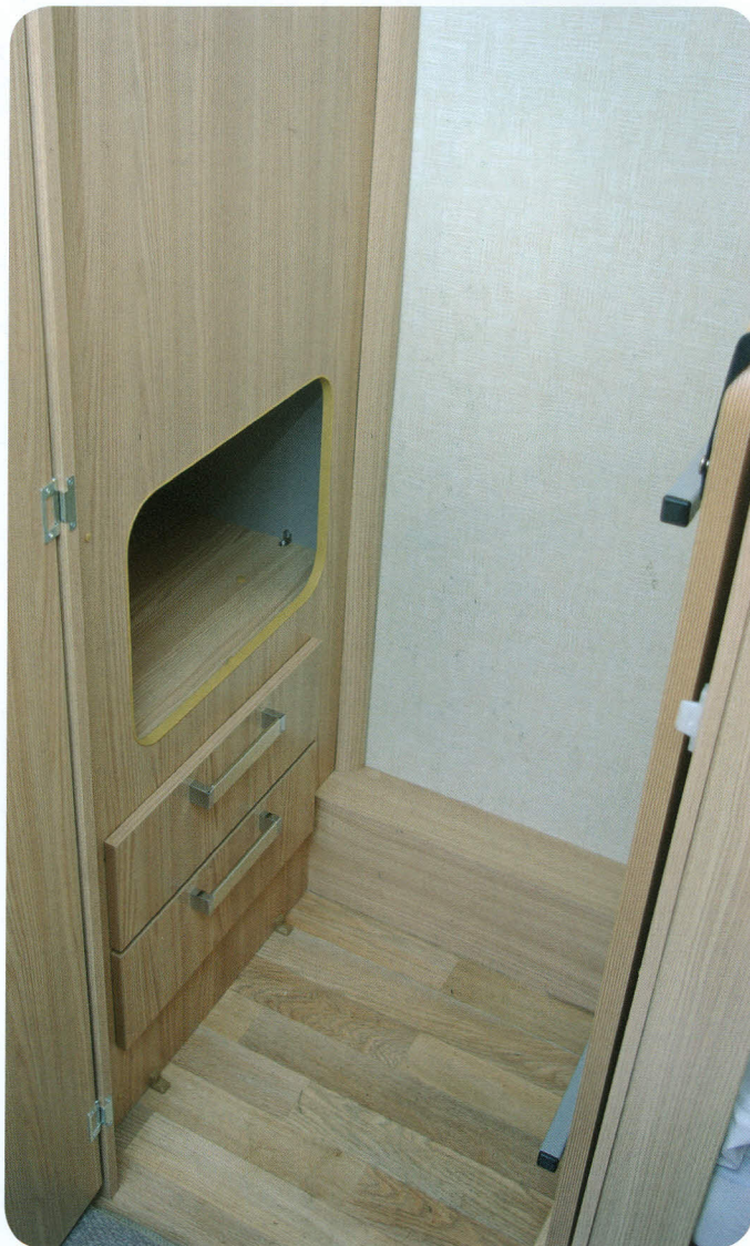
◆ The Pastiche 525/4 walk-in wardrobe hides a cubby hole and two drawers. It also makes a convenient store for the table.