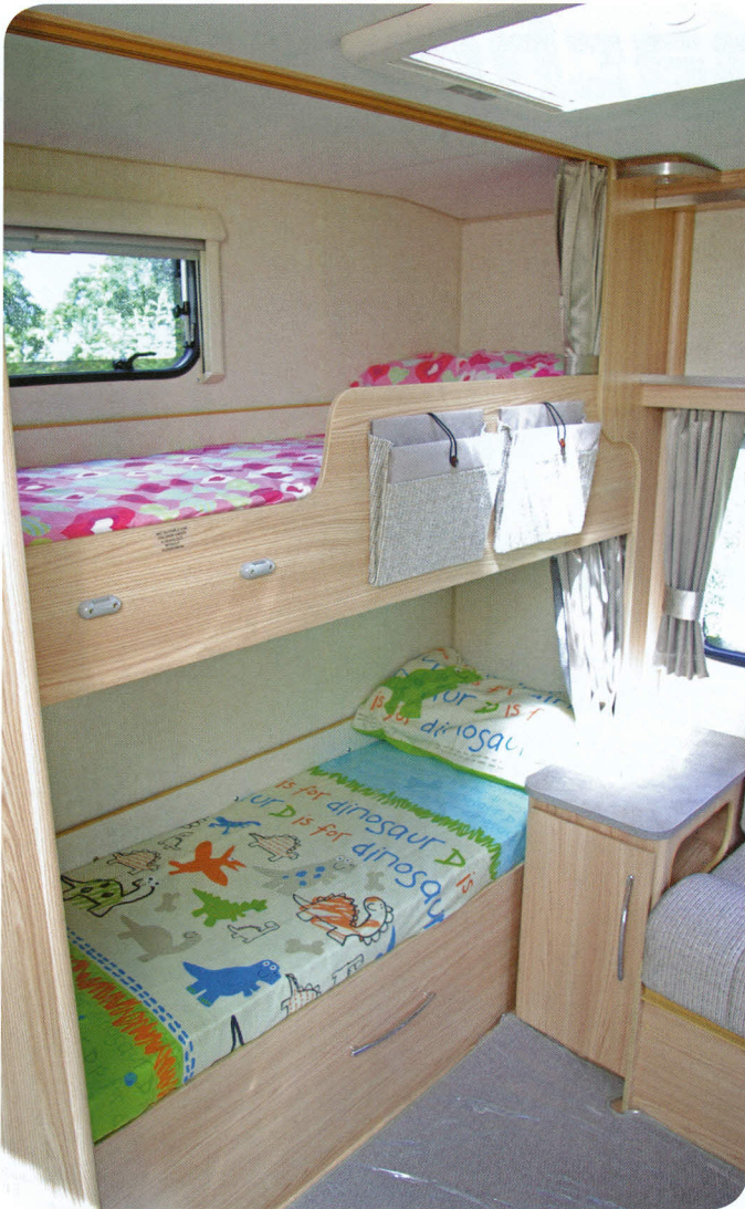
◆ Amara 580/5 bunk beds.