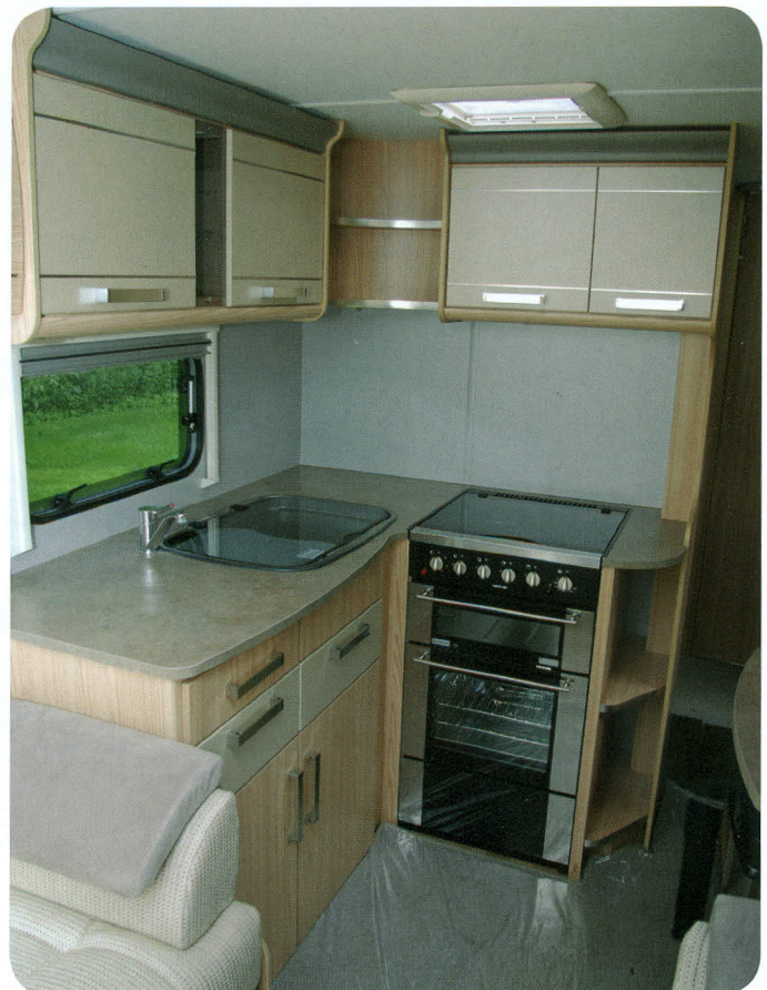
◆ Pastiche 525/4 L-shaped kitchen.

Laser models have the same detailed changes as their smaller VIP siblings but gain the 620/4 - a new layout that breaks the current mould for UK built twin axle caravans by not having a fixed bed. The result is a wonderfully spacious caravan with long front bunks, generous side dinette, 175 litre fridge freezer, spacious washroom