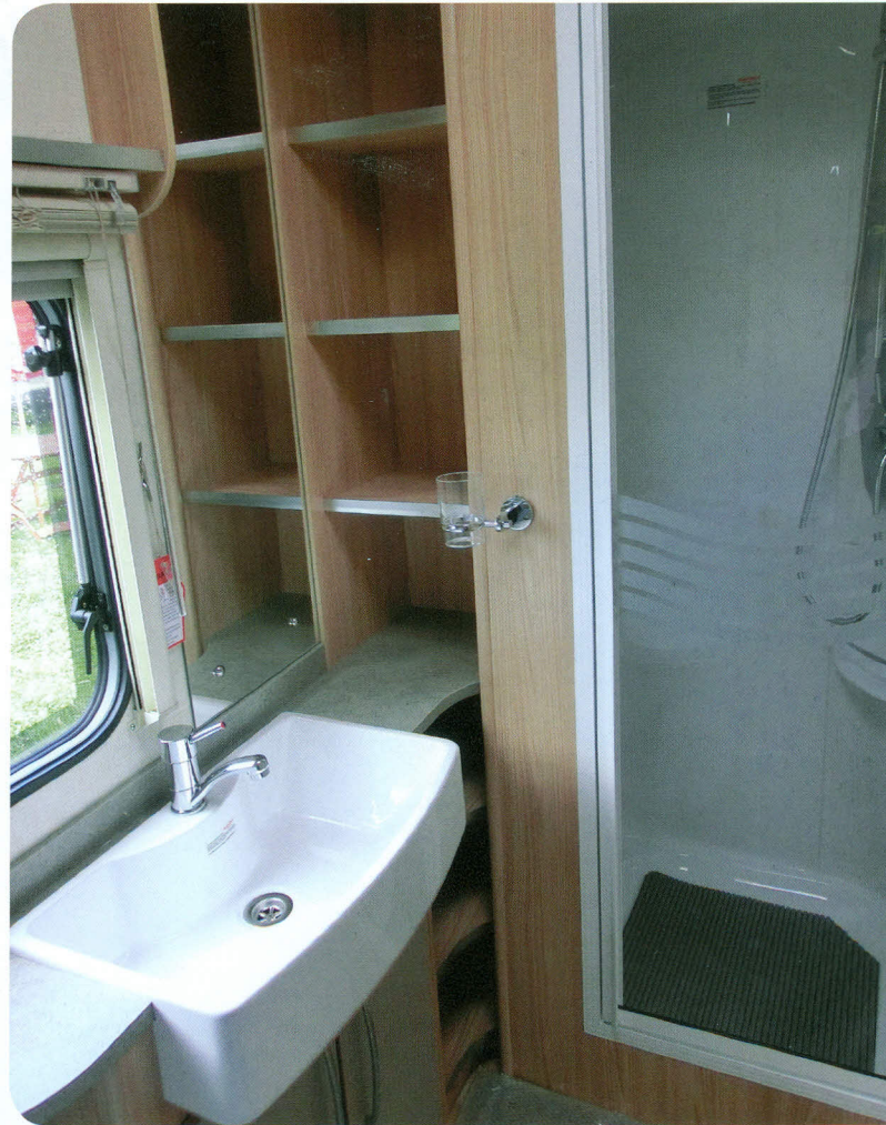
◆ A Belfast sink and the clever use of a mirror help to give this Amara washroom a spacious feel.