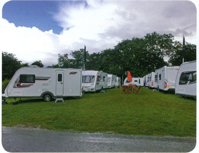
◆ The storm clouds regroup for another attack!

Pastiche caravans gain the Thetford 113 litre fridge with an automatic energy search function so the fridge always selects the