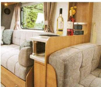
One of two television positions has two surfaces, one above the other