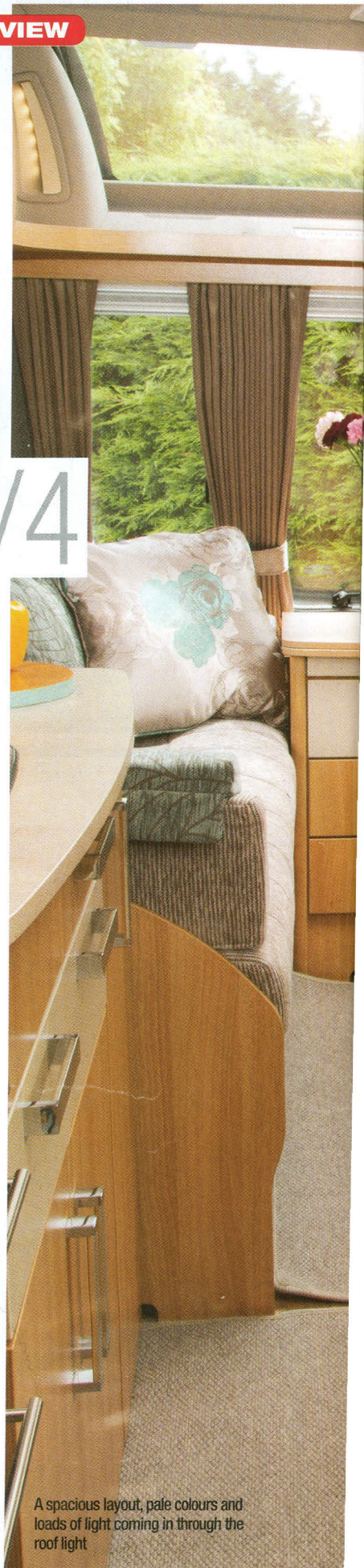
A spacious layout, pale colours and loads of light coming in through the roof light