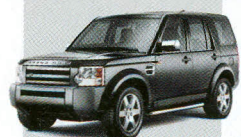
LAND ROVER 2583KG