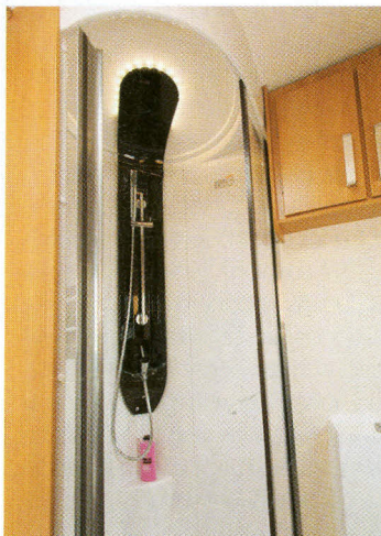
Bright lights surround the top of the shower unit