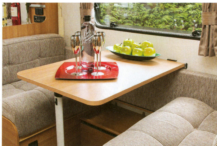
A wide dining area – and a delightful strip of LED lights above

A small but important addition to road equipment comes with Lasers for 2013; a scissor jack is now standard.