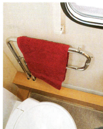
A heated towel rail – part of the Alde central heating system