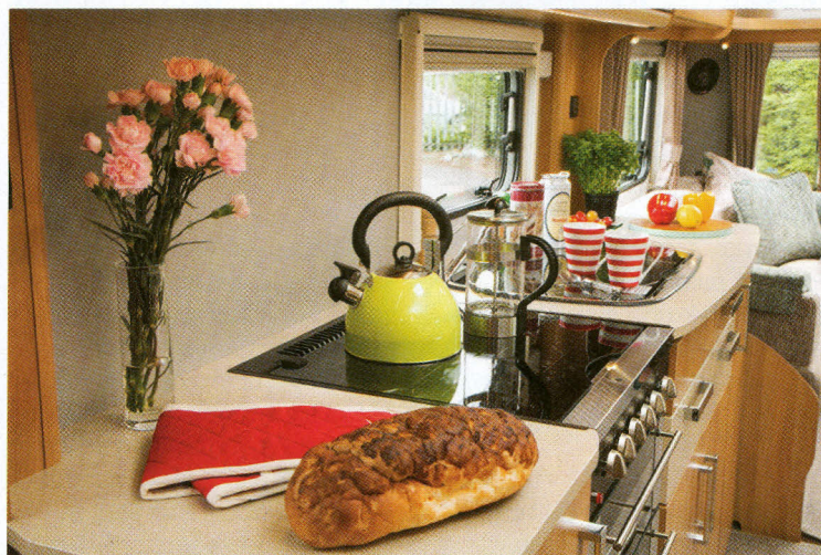
The 620's kitchen is just over 2m in length