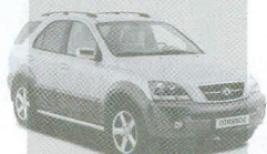
KIA SORENTO 2008KG