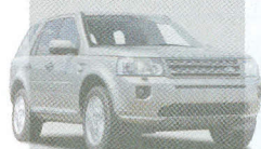
FREELANDER 2 1785KG