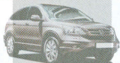
HONDA CRV 1890KG