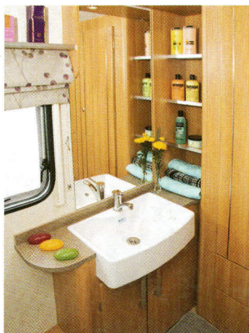
A big rectangular washbasin and loads of shelving alongside the wardrobe