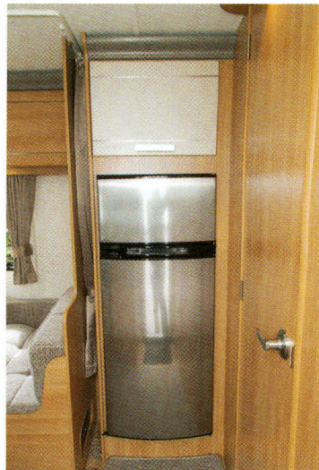
The 175-litre fridge-freezer sits between the dining area and the shower room