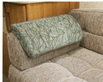
All four armrests have removable top sections to give you a choice of depths