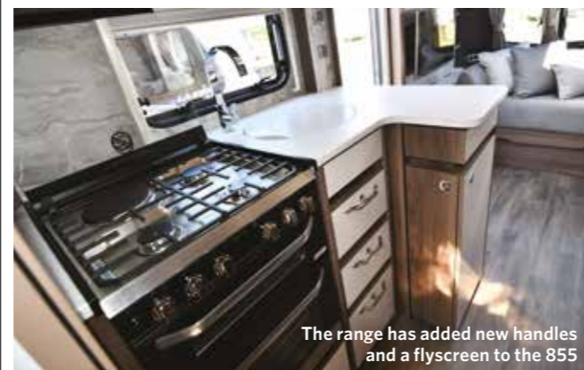
The range has added new handles and a flyscreen to the 855

The lower series of windows offers ventilation and a closed