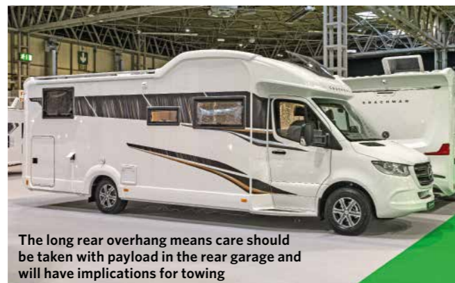
The long rear overhang means care should be taken with payload in the rear garage and will have implications for towing

There are plenty of storage spaces around to keep your stuff neatly out of the way, with nets and doors to hold things securely on the road.