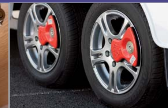
Al-ko Secure wheel clamping system