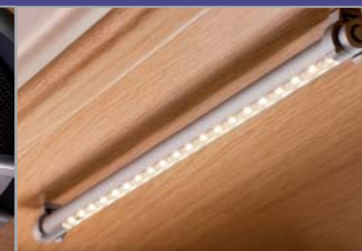
LED kitchen strip lights