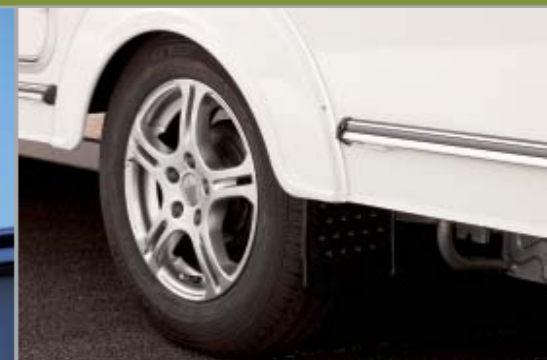
Dirt reducing mud flaps