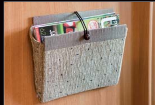
Convenient magazine storage (model specific)