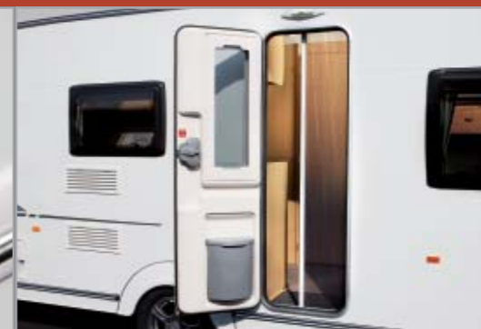
Convenient door flyscreen