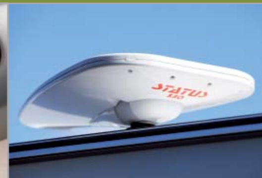
STATUS 530 swivel directional TV aerial