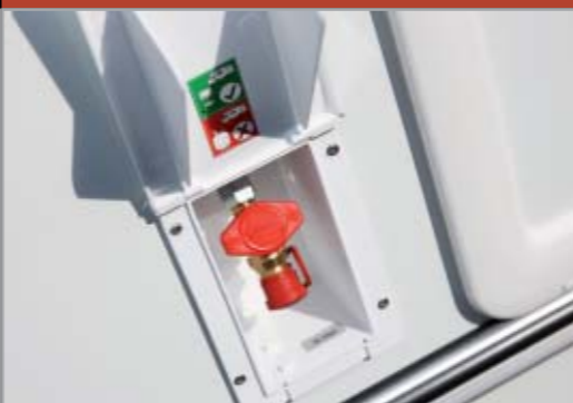
Easy access external BBQ point