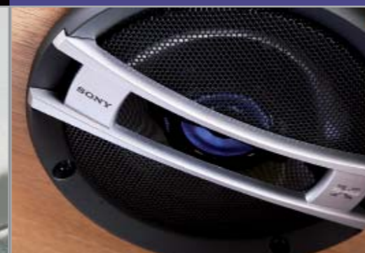
Sony entertainment centre