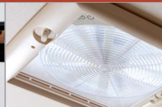
Omnivent rooflight extractor fan