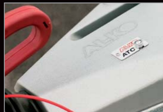
Al-ko ATC system (Active Trailer Control)