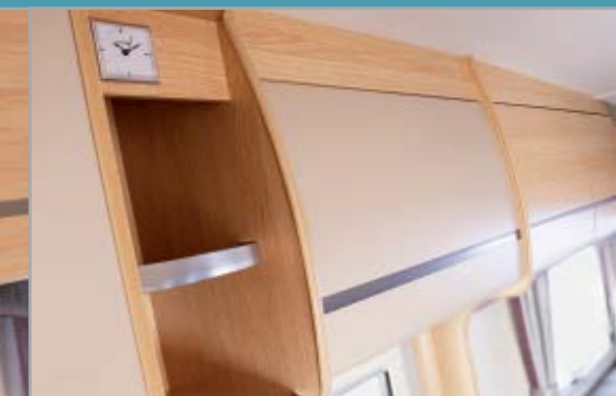
Stylish locker doors with metallic trim