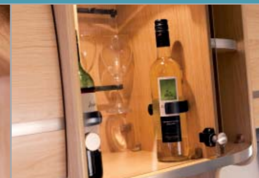
Contemporary cocktail cabinet