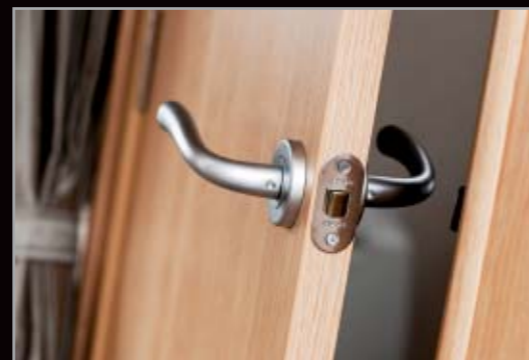
Domestic style bathroom door and handle