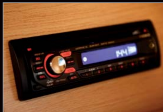
High quality Sony entertainment system